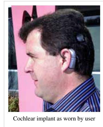
Cochlear implant as worn by user

The device is surgically implanted under a general anesthetic, and the operation usually takes from 1½ to 5 hours. First a small area of the scalp directly behind the ear may be shaved and cleaned. Then an incision is made in the skin behind the ear and the surgeon drills into the mastoid bone, creating a pocket for the receiver/stimulator, and then into the inner ear where the electrode array is inserted into the cochlea. The patient normally goes home the same day or the day after the surgery, although some cochlear implant recipients stay in the hospital for 1 to 2 days. As with every medical procedure, the surgery involves a certain amount of risk; in this case, the risks include skin infection, onset of (or change in) tinnitus, damage to the vestibular system, and damage to facial nerves that can cause muscle weakness, impaired facial sensation, or, in the worst cases, facial paralysis. There is also the risk of device failure, usually where the incision does not heal properly. This occurs in 2% of cases and the device must be removed. [citation needed]