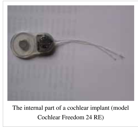
The internal part of a cochlear implant (model Cochlear Freedom 24 RE)