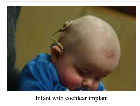
Infant with cochlear implant

Another group of customers are parents of children born deaf who want to ensure that their children grow up with good spoken language skills. The brain develops after birth and adapts its function to the sensory input; absence of this has functional consequences for the brain, and consequently congenitally deaf children who receive cochlear implants at a young age (less than 2 years) have better success with them than congenitally deaf children who first receive the implants at a later age, [17] though the critical period for utilizing auditory information does not close completely until adolescence. Additionally, a 2010 study into bilateral implantation showed that children who receive their first cochlear implant before the age of 1½ responded well to the second one, even if the second one was implanted as late as 9 years old. In contrast, children who got their implants at age 2½ years or later did not respond as well to the later second implant, regardless of when they received it. [1] One doctor has said "There is a time window during which they can get an implant and learn to speak. From the ages of two to four, that ability diminishes a little bit. And by age nine, there is zero chance that they will learn to speak properly. So it's really important that they get recognized and evaluated early." [1]